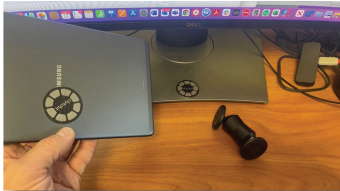
Steel discs mounted to tablet back and surface