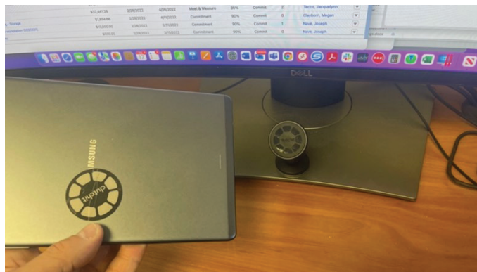
Steel discs and magnet mount attached to surface